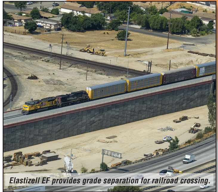
Elastizell EF provides grade separation for railroad crossing.