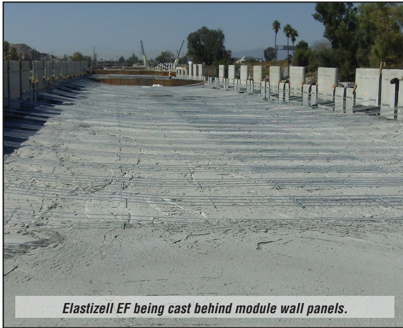
Elastizell EF being cast behind module wall panels.